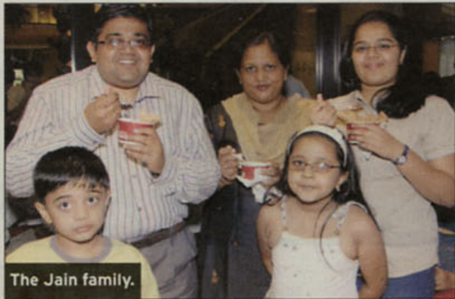
The Jain family.