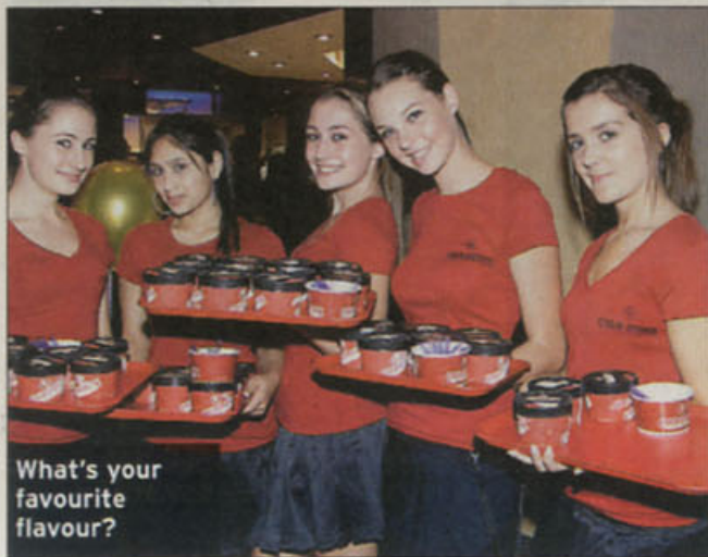
What's your favourite flavour?